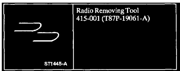
Radio Removing Tool